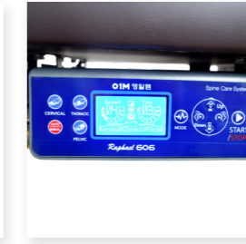
Integrated Electronic Control Panel Controllable the drop and flexion at the same time with integrated electronic control panel