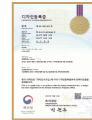
Registered Patent of Design

Raphael 606 Story of Development Design Raphael 606 - PR is the first Korean Leander table which was developed in the United States through a licensing contract. It was improved with clinical studies from doctors and technological innovation of YOUNG ILM.