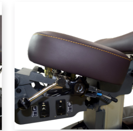
Abdominal cushion adjustable Break-Away abdominal cushion for pregnant, large abdomen patients