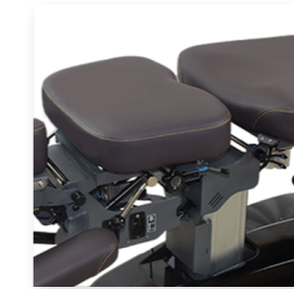
Center-Forward Auto Drop YOUNG ILM's patented technology Center-Forward vertical drops applied