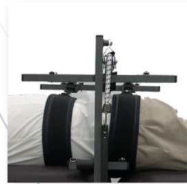
Latest Scoliosis Belt The set of scoliosis belt is used to treat scoliosis patients