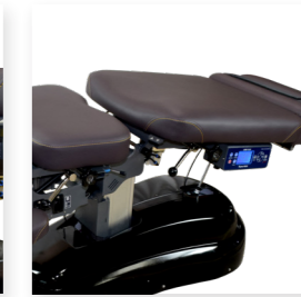
Pattern and memory function Easy use with pattern and memory functions with YOUNG ILM's technology